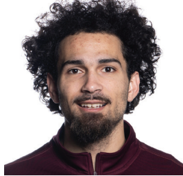
2 POP ISAACS