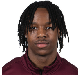
1 JOSH HOLLOWAY