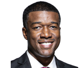
AC TJ CLEVELAND