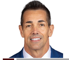
SC DARBY RICH