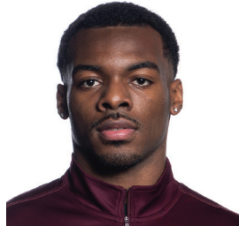
5 JACARI LANE