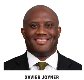
AC | 1st season