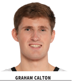
Senior // Guard 6'5" // 210 Charlotte, N.C. Charlotte Latin School