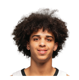
Freshman 6'2" // 190 Atlanta, Ga. Riverwood Intl. Charter KARE-iss buh-LAWL