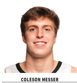
15 | Sophomore 6'4" // 210 | Dallas, Texas | Highland Park HS