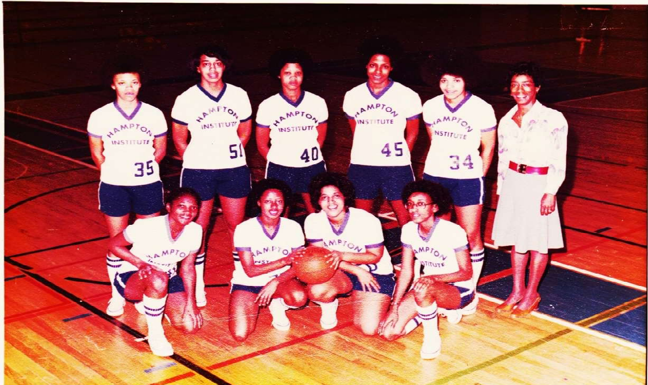
Hampton's fielded its first women's sports team: women's basketball in 1975-76