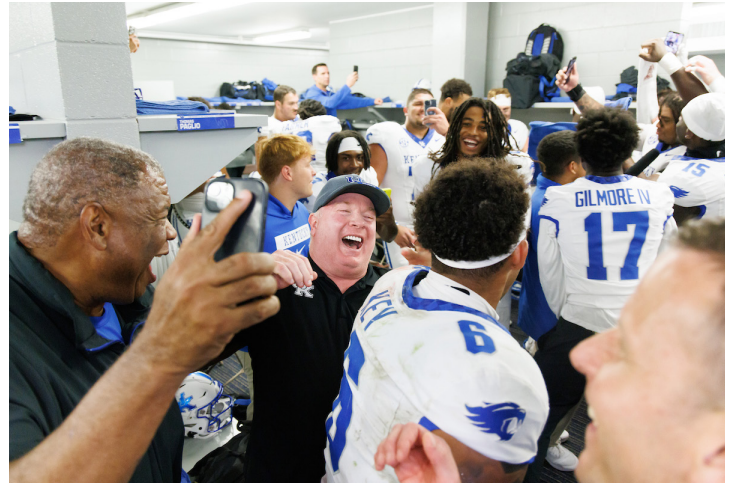
Kentucky celebrated after defeating No. 6/5 Ole Miss earlier this season on the road, its highest-ever AP-ranked win on a SEC campus

Kentucky has had 10 game-winning fourth quarter scores in SEC play, and 16 total, under Coach Mark Stoops