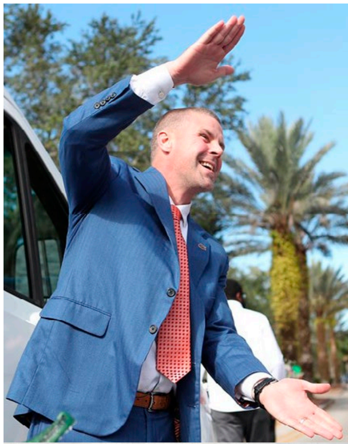
BILLY NAPIER compiled a 40-12 record in four years as head coach at the University of Louisiana Lafayette.

Napier's deep roots in the game include stints on both Clemson coach Dabo