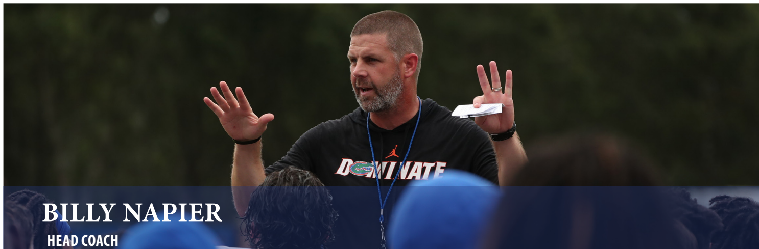
BILLY NAPIER HEAD COACH

Billy Napier enters his first season with the Gators after being named the 29th head coach in program history on Nov. 28, 2021