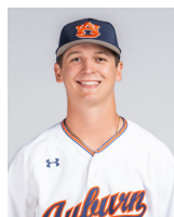
21 TRACE BRIGHT