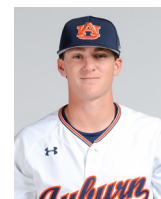
37 MASON LAND