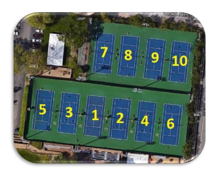
Centennial Sportsplex Courts