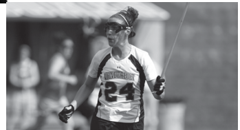
PLAYER BIOS PAGES 8-15