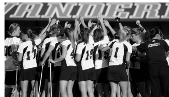
2010 PREVIEW PAGES 4-5