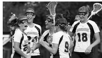
HISTORY/RECORDS PAGES 21-24