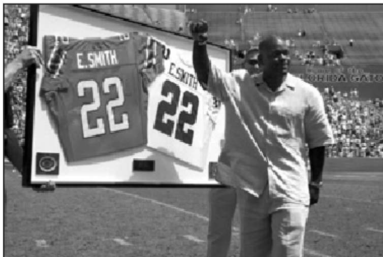
On April 12, 2003, Emmitt Smith was honored at halftime of the 2003 Orange and Blue Spring game.

Former Gator star Emmitt Smith became the NFL's all-time leading rusher on Sunday, Oct. 27, 2002, with an 11-yard run against the Seattle Seahawks in Dallas. Smith surpassed the long-time record held by Walter Payton, who rushed for 16,726 yards.