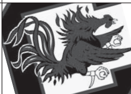
SOUTH CAROLINA PROJECTED: 2010

Vanderbilt is a charter member of the American Lacrosse Conference, which played its inaugural season in 2002. The Commodores won the league championship that season with a perfect 6-0 record. Two seasons later, Vanderbilt would capture the 2004 conference title and earned the ALC's first-ever automatic bid to the NCAA Tournament.