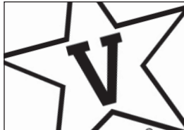
VANDERBILT 2008: 13-6, 3-1