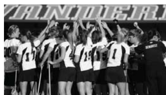
2009 PREVIEW PAGES 4-5