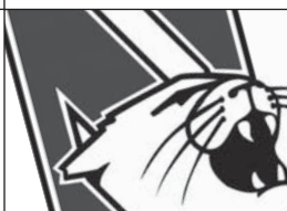
NORTHWESTERN 2008: 21-1, 4-0 NATIONAL CHAMPIONS