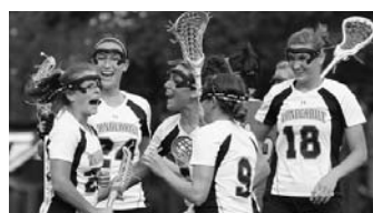
HISTORY/RECORDS PAGES 21-24