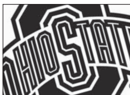
OHIO STATE 2008: 10-8, 1-4