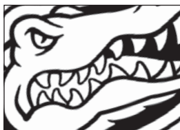
FLORIDA PROJECTED: 2010