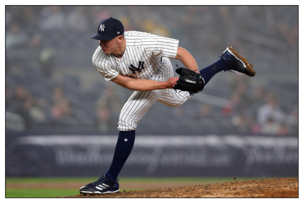
Chad Green pitches against the Twins in the sixth inning at Yankee Stadium on April 25, 2018.