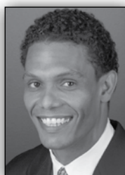
King Rice Men's Basketball Staff