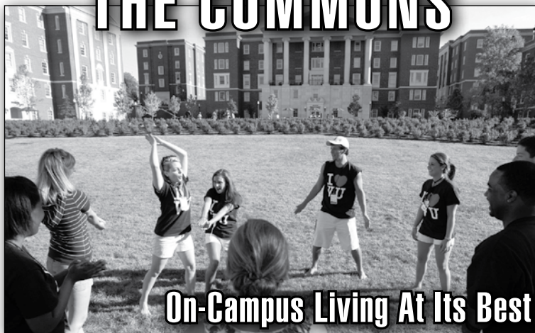
On-Campus Living At Its Best