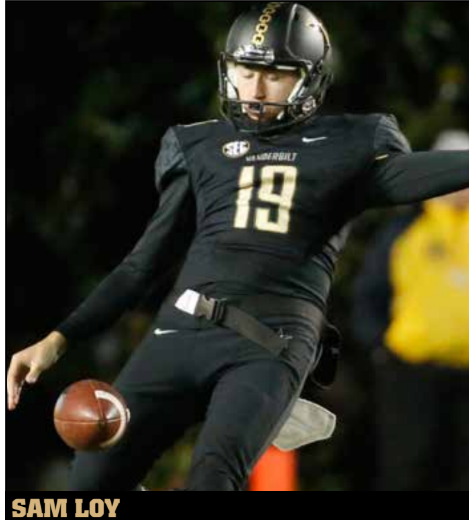
As a true freshman in 2016, Loy averaged 41.6 yards.