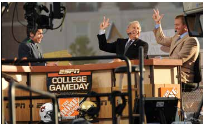
In 2008, ESPN aired its popular College GameDay Show from The Ingram Commons.

The Ingram Commons also was showcased in October 2008 when ESPN selected the site as its location for the popular College Football GameDay broadcast prior to airing Vanderbilt's victory over Auburn on campus.