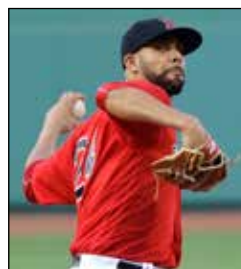
First-year Red Sox David Price is a perennial MLB All-Star and one of the game's most dominating pitchers.

Cleveland and is regarded among the most knowledgeable NBA writers; Buster Olney is ESPN's top baseball analyst; and Skip Bayless has just signed a mega-contract to join FOX Sports.