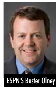
ESPN'S Buster Olney