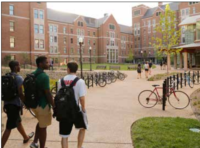
Warren and Moore college halls opened in 2015 on the main campus, adding to Vanderbilt's reputation for unique, on-campus living experiences for its students.