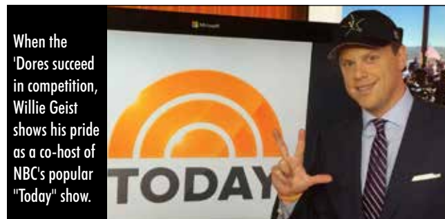
When the 'Dores succeed in competition, Willie Geist shows his pride as a co-host of NBC's popular "Today" show.