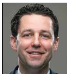
BRYCE DREW Men's Basketball