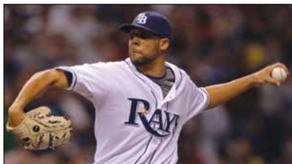
After his Vanderbilt career, David Price was MLB's No. 1 draft pick in 2007. Starting pitcher in the 2010 MLB All-Star Game, Price was the 2012 American League Cy Young Award winner.