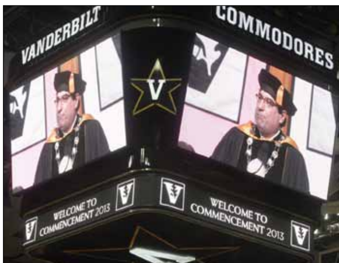
Shown on the Memorial Gym video board, Zeppos addresses guests attending 2013 Commencement ceremonies.

geographical backgrounds. The expanded aid program is top university priority and is funded by a combination of strategic budget allocations and gifts from thousands of generous donors to Opportunity Vanderbilt, a campaign to increase undergraduate scholarship endowment.