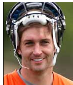
Chicago Bears starting quarterback Jay Cutler