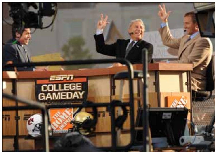
In October 2008, ESPN aired its popular College GameDay Show from The Ingram Commons.