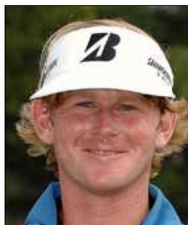
2012 PGA Tour Fed Ex Cup champ Brandt Snedeker