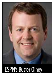
ESPN's Buster Olney