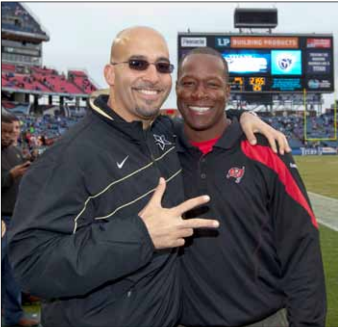
Franklin and Tampa Bay Bucs Head Coach Raheem Morris. The two served as coordinators at Kansas State in 2006.

Franklin's first Vanderbilt team notched four more victories than the 2009 and 2010 Commodore teams. They recorded five home wins, the most by a Commodore squad since the mid-1990s. They also outscored their opponents by 73 points, a remarkable 244-point improvement over the previous year. The point differential by the Commodores is the largest since 1974.