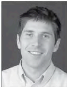
John Butler Ticket Office