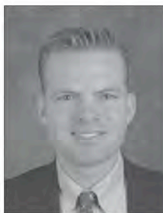
John Thorpe Facilities