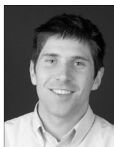
John Butler Ticket Office