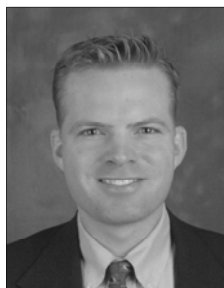
John Thorpe Facilities