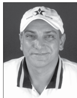
"Magic" Noori Food Coach