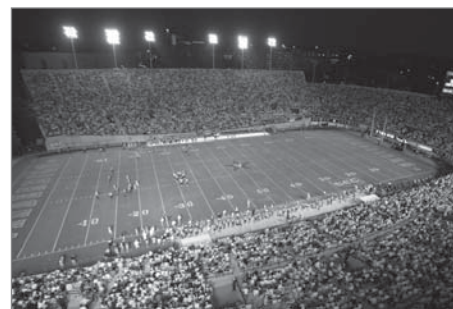
Vanderbilt Stadium – Nashville, Tenn.

Vanderbilt Athletics 2601 Jess Neely Drive Nashville, TN 37212