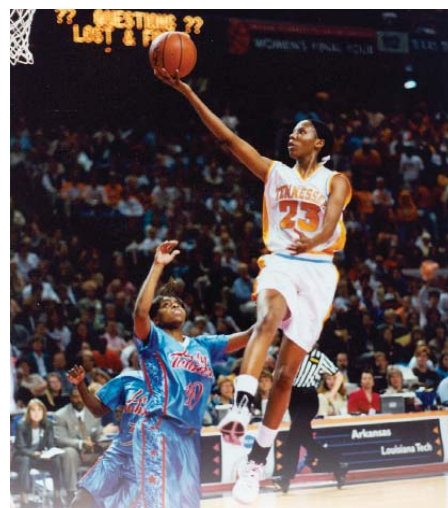
TENNESSEE 2012 SEC GREAT Chamique Holdsclaw Lady Vol Basketball -- 1995-1999

The Naismith Player of the Century and four-time Kodak All-American, Chamique Holdsclaw led the Lady Vols to a 131-17 overall record and three consecutive national championships from 1996-98. She is the program's all-time leader in scoring (3,025 points) and rebounds (1,295). The NCAA Tournament most outstanding player in 1997 and 1998, she still holds the record for points (479 points, 21.8 ppg) and rebounds (198 rebounds, 9.0 rpg) accumulated in tournament games. The first two-time winner of the Associated Press Player of the Year Award, Holdsclaw garnered 34 individual awards during her career, including 21 player of year honors from a variety of organizations. In 2006, she was named to the NCAA 25th Anniversary Team after being named to the Kodak 25th Anniversary Team in 1999.