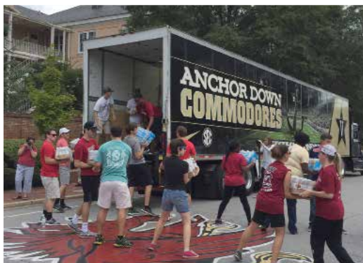
South Carolina student and alumni gather Oct. 9 to off-load two semi-trailers filled with bottled waters and other relief collected by Vanderbilt on Oct. 8.

With the Palmetto State faced with historic flooding, Vanderbilt Athletics asked Nashville-area residents to band together and help fill its football equipment truck with bottled water and generators. The response