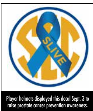
Player helmets displayed this decal Sept. 3 to raise prostate cancer prevention awareness.

Vanderbilt-Ingram Cancer Center experts are also onboard for this important awareness and prevention campaign. VICC provides multi-disciplinary care for men seeking information, screening options and leading-edge treatment for prostate cancer. Men who want to know more about their risks for prostate cancer or who are seeking care may schedule an appointment at VICC by calling toll free 1-877-936-8422.