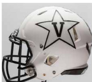
WHITE 2012 intro; matte finish, enlarged "StarV" decal added in 2015