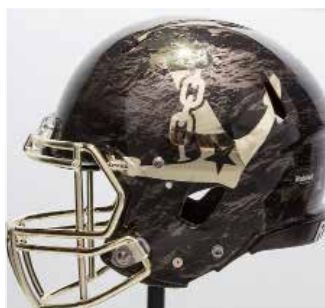
DEEP WATER Ocean-inspired HGI alternate design introduced this year