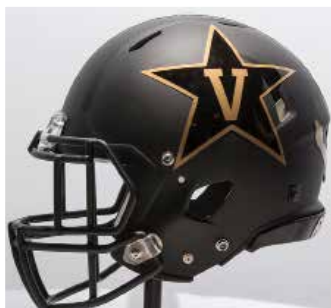
BLACK 2011 intro; matte finish in 2014, enlarged "StarV" decal added in 2015