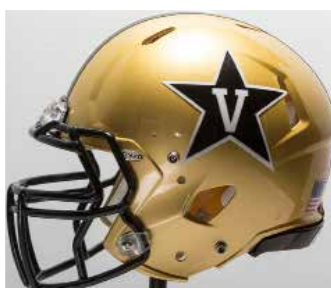
OLD GOLD No design change to helmet that was introduced in 2002