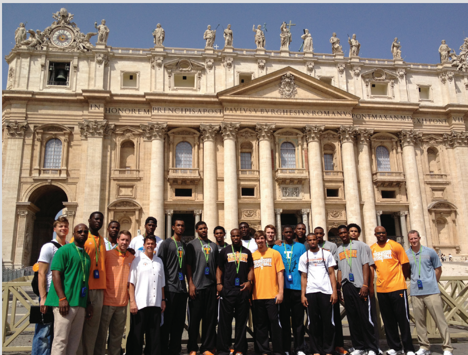
The Tennessee basketball team and staff outside St. Peter's Basilica in Vatican City.