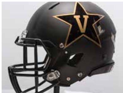
BLACK MATTE Introduced in 2011; Matte finish in 2014; enlarged "Star V" decal added this year