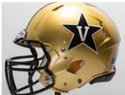
OLD GOLD No design change to helmet that was introduced in 2002