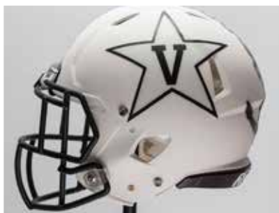
WHITE MATTE Introduced in 2012; matte finish & enlarged "Star V" decal added this year