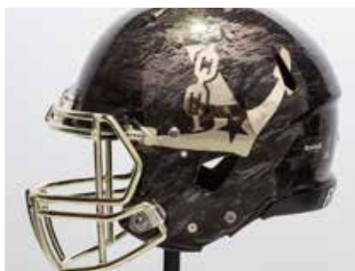
DEEP WATER Ocean-inspired HGI alternate design introduced Aug. 16; anchor decal also new