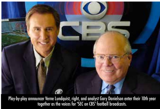
Play-by-play announcer Verne Lundquist, right, and analyst Gary Danielson enter their 10th year together as the voices for 'SEC on CBS' football broadcasts.