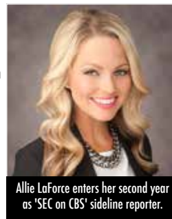
Allie LaForce enters her second year as 'SEC on CBS' sideline reporter.

Lundquist and Danielson are entering their 10th season together as the featured voices of 'SEC on CBS' games. LaForce enters her second year on the 'SEC on CBS' crew.