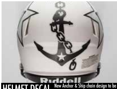
HELMET DECAL New Anchor & Ship chain design to be featured on white & black helmets