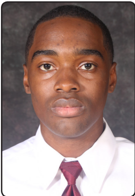
12 Green Hill