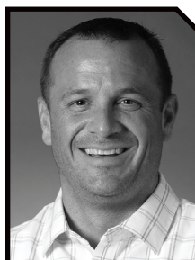
Jeff Walz Head Coach